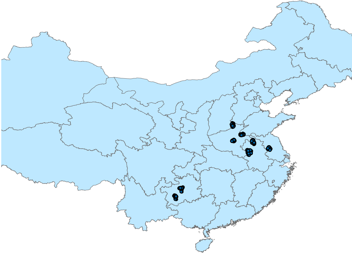
Figure A.1: Provinces and Counties Where RCT Was Implemented

Notes: Map shows the location of our eight RCT counties in the three provinces of Anhui, Guizhou and Henan. The dots indicate participating villages and the boundaries indicate Mainland Chinese provinces. Section Design/Data Section and Appendix F for discussion.